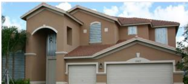
Aluminum Panel Shutters