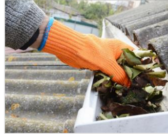
Debris in Gutter