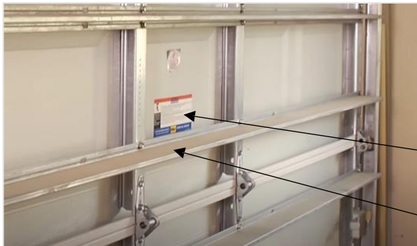
Sticker Identifying Thickness and Impact Resistance