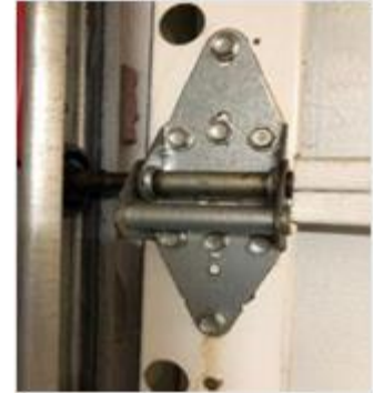
Track and Roller