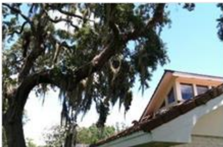
Tree Branches Hanging Over Roof